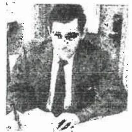
Mr. DeSantis Shop